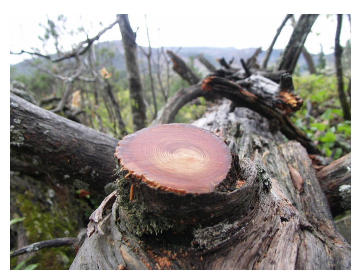
A fallen cedar along the trail

The trail begins on Rt9N directly across from Hurricane Mountain Road. From Keene Valley, go north on Rt73 until reaching RtoN, turn east and park along the road across from Hurricane Mountain Road. The trailhead is marked with a sign and one soon passes under a power line. Around mile 0.7 there are some notable switch backs. Around mile 0.9 the trail levels and reaches a junction. The route to Baxter rises steeply for a bit, reaching state forest land and views back around mile 1.0. There are very nice views from time-to-time beginning at mile 1.1 until the main views at mile 1.3. Returning by retracing our steps, though sampling different viewpoints perhaps, returns to the road at mile 2.7.