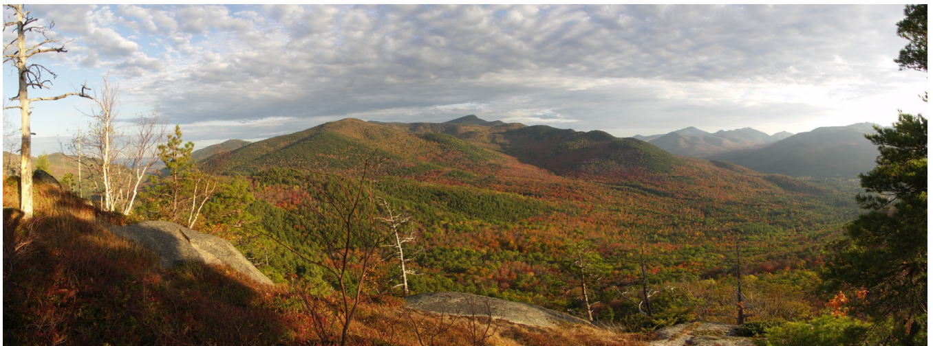
A fall view from Baxter toward Giant