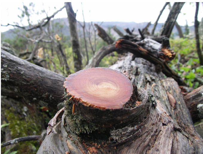
A fallen cedar along the trail

The trail begins on Rt9N directly across from Hurricane Mountain Road. From Keene Valley, go north on Rt73 until reaching Rt9N, turn east and park along the road across from Hurricane Mountain Road. The trailhead is marked with a sign and one soon passes under a power line. Around mile 0.7 there are some notable switch backs. Around mile 0.9 the trail levels and reaches a junction. The route to Baxter rises steeply for a bit, reaching state forest land and views back around mile 1.0. There are very nice views from time-to-time beginning at mile 1.1 until the main views at mile 1.3. Returning by retracing our steps, though sampling different viewpoints perhaps, returns to the road at mile 2.7.