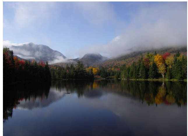
Marcy Dam Reflection

The descent remains generally steep until the trail turns to follow a ravine at mile 8.3. The trail reaches the trail along Lake Colden at mile 8.9. Our route turns right, skirting Lake Colden for a while and reaches the junction at the far side of the lake at mile 9.4. The route gets to Avalanche Lake at mile 9.7 and the next half mile is packed full of dramatic views of the cliffs of Avalanche Mountain, the lake and the incredible rock on Mt Colden. By mile 10.7 the route reaches Avalanche Pass and the trail descends to the junction with the trail to Lake Arnold used earlier (mile 11.3). From here it retraces earlier steps to Marcy Dam at mile 12.5, the register at mile 15.2 and the road at mile 15.4.