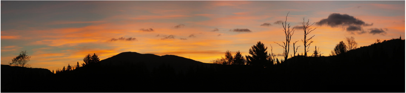
Sunrise in North Elba