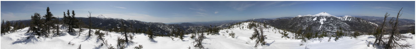
On Colden above the snow